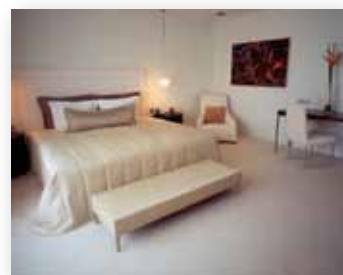
Spa Secrets Magazine www.spasecretsmagazine.com